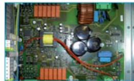
Main power board for rectification and inversion