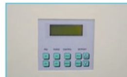
Operating touch pad with display