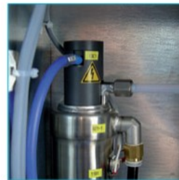
Ozone generation module showing the HV, cooling water and gas connections